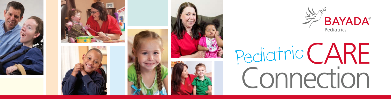
Volume 5, Number 1 • Spring | A publication for clients of BAYADA Home Health Care | Celebrating 41 years of compassion, excellence, and reliability | www.bayada.com