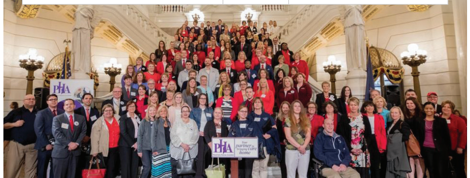
Home care advocates gather on the steps of the Capitol in Harrisburg during the 2017 Lobby Day, sponsored by the PA Home Care Association.